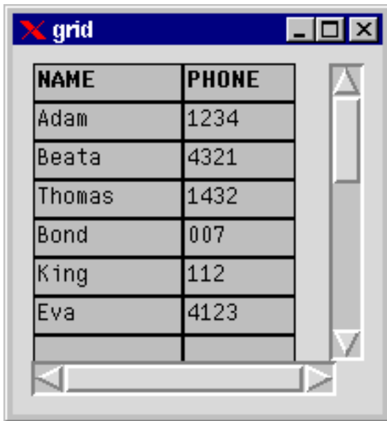
Figure 8.14: Simple Grid

The following simple example shows how to use the grid.