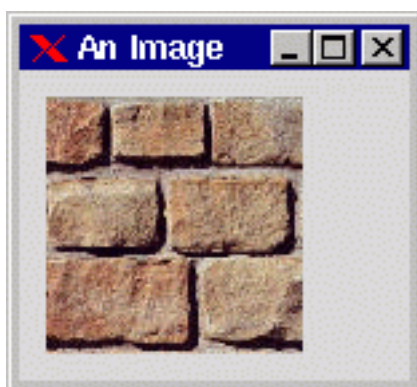
Figure 8.7: Canvas Image Object

The canvas image object displays images and moves them around in a simple way. The currently supported image formats are bitmap and gif.