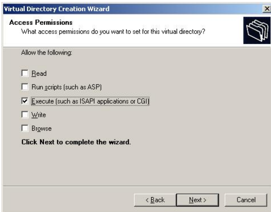
Figure 5-7: Enabling CGI Mode