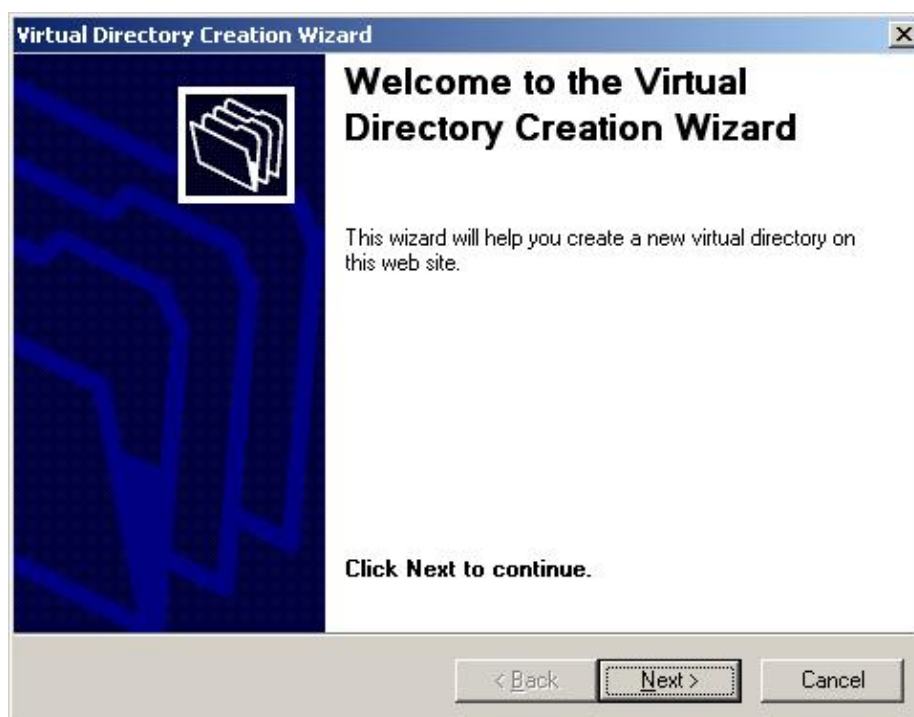
Figure 5-4: The Virtual Directory Creation Wizard Window