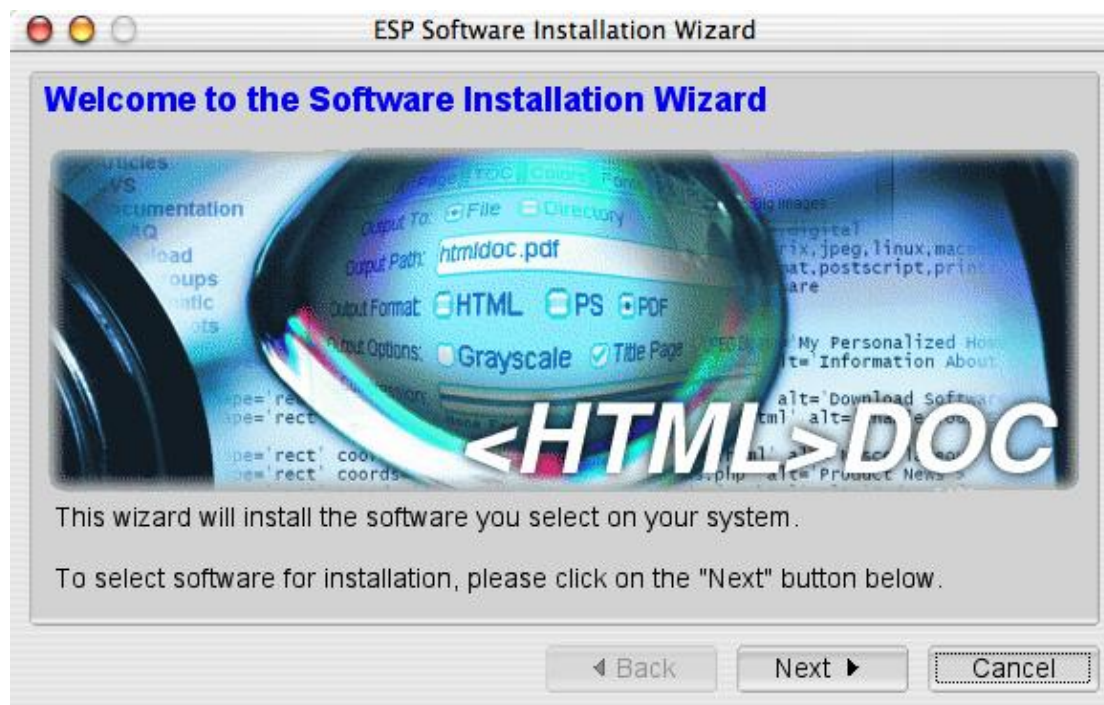
Figure 1-2: The software installation wizard

Double-click on the Install icon in the Finder window to start the software installation wizard (Figure 1-2) and follow the installer prompts.