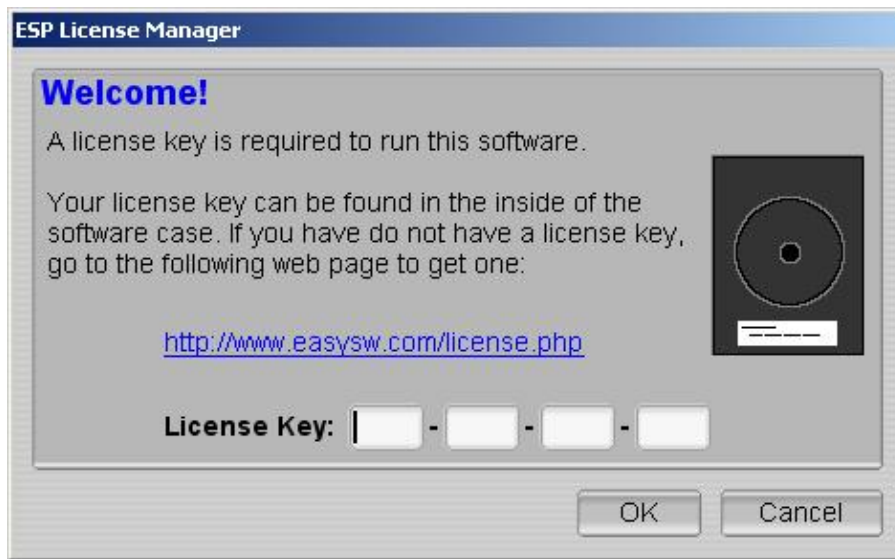
Figure 1-4 - The HTMLDOC License Dialog

Enter the license key that was emailed to you or came on the inside of the HTMLDOC CD-ROM case and click on the OK button. Click on the Close button to start using the software.