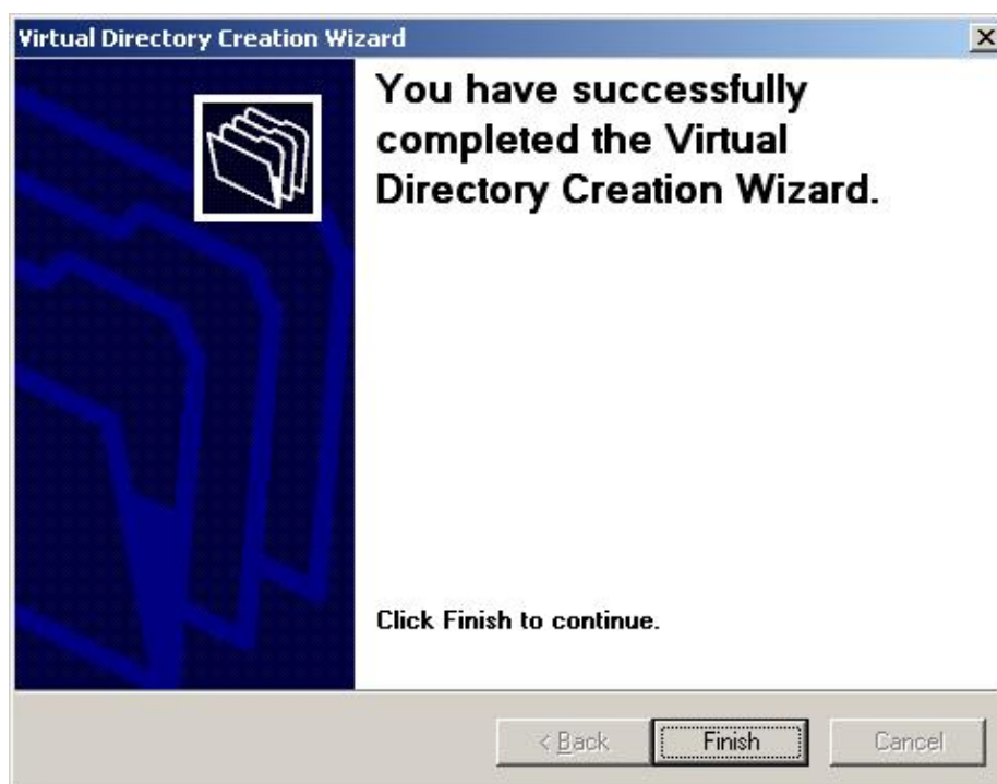
Figure 5-8: Completion of IIS Configuration

Once configured, the htmldoc.exe program will be available in the web server directory. For example, for a virtual directory called cgi-bin , the PDF converted URL for the superproducts.html page would be as follows: