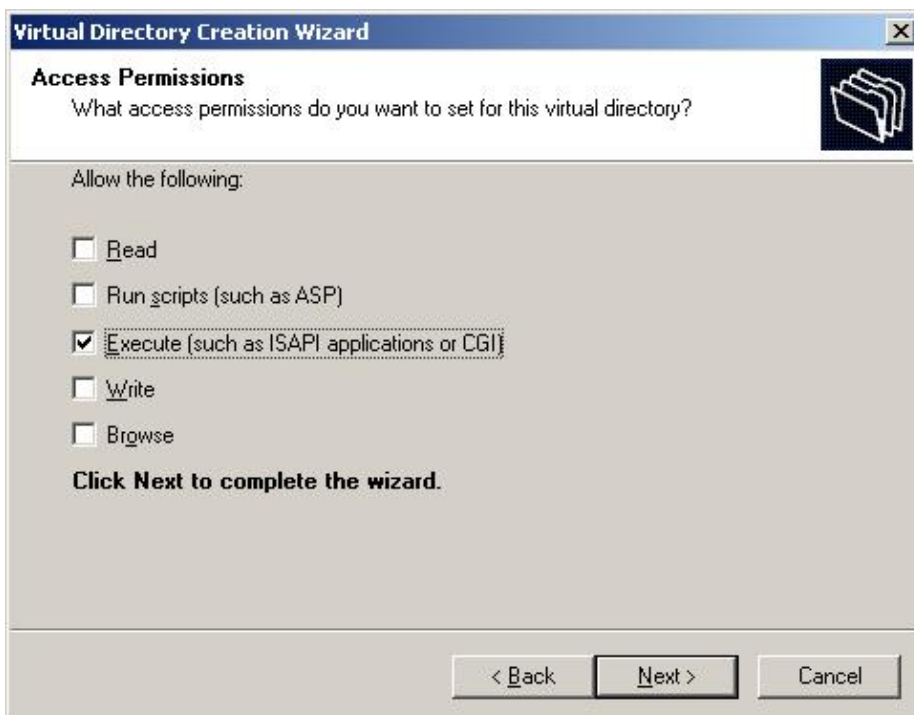
Figure 5-7: Enabling CGI Mode